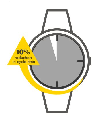
FIGURE 1: Some Elastron customers that have switched to TPE compounds based on Shell Risella X have been able to reduce cycle times by 10% compared with compounds based on conventional ails.

"Fogging occurs when volatile components are released from interior components under circumstances such as high temperatures and are